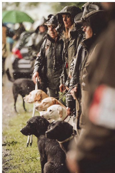
It certainly did rain at the Novice Test

At the end of this season I am stepping down from the Working Test role and will miss the camaraderie of the Guildford committee. It's been a pleasure to work with you all.